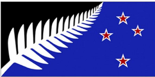
Silver Fern (Black, White and Blue) Designed by: Kyle Lockwood