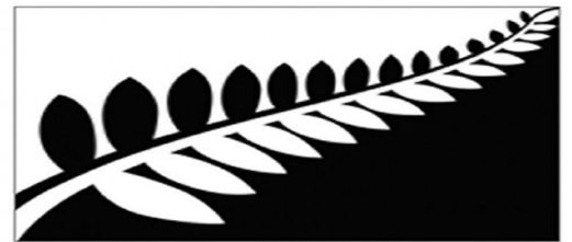
Black & White Fern Designed by: Alofi Kanter

New Zealanders are changing of flag, take part in votation before December 17th.